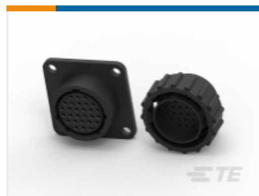
TE Part # CAT-AM71-C83998M CPC Connectors, Series 2