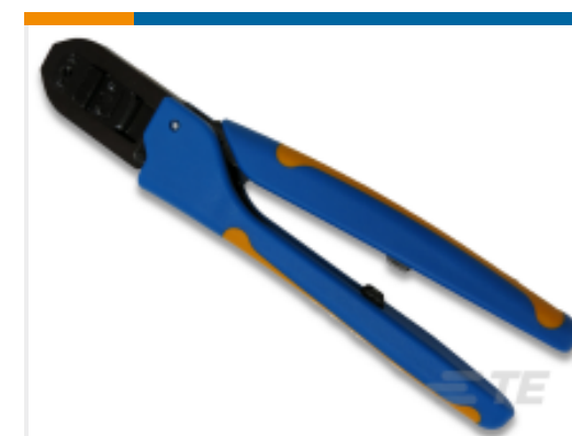
TE Part # 91503-1 CCII AMPLIMITE 20 DF PIN SKT 28-20 ASSY