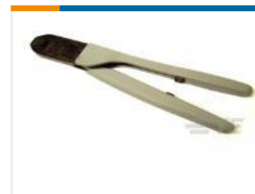
TE Part # 91549-1 CCII HD-20 PIN SKT 28-24 ASSY