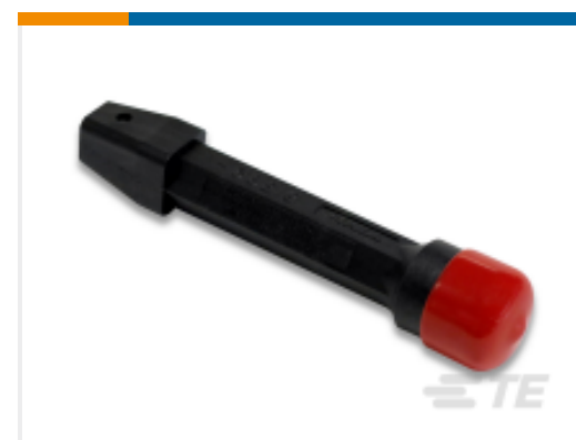
TE Part # 91285-1 INSERT/EXTRACT TOOL ASSEMBLY