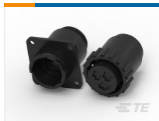
TE Part # CAT-AM71-C83998BB CPC SERIES 3