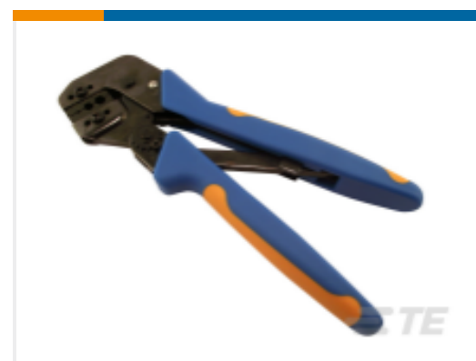
TE Part # 58448-2 PRO CR. ASSY AMPLIMITE IS 9357