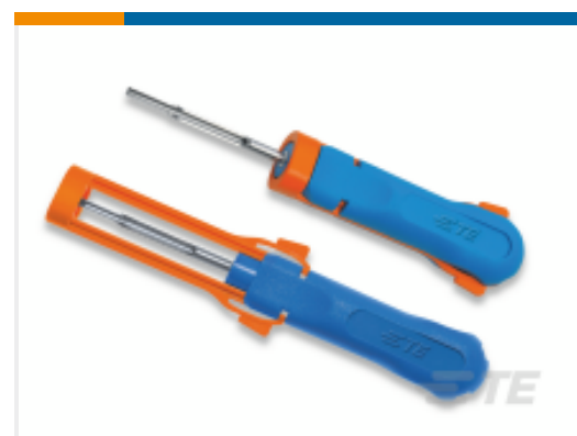
TE Part # 1579007-9 EXTRACTION TOOL